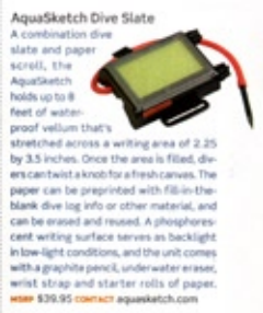
Sport Diver May 2008

Sketchy Idea There's no need to worry about flooded cameras while capturing underwater scenes if you sketch them on an AquaSketch slate. The new slate features rolls of waterproof vellum that can be advanced on rollers underwater. When one screen is full, just turn the knob to get a fresh writing or drawing surface. Besides sketches, the slate is handy for logging detailed notes as a dive progresses, and vellum can be backed up on the phosphorescent writing surface in low-light conditions. Plans can be laser printed on the vellum to reduce chances of error during complex dives. The durable vellum can be erased for reuse or even replaced while underwater. Slates are available in 8.5- by 11- and 5- by 7-inch sizes plus a 2.25- by 3.5-inch wrist-mount model. Learn more at www.aquasketch.com .