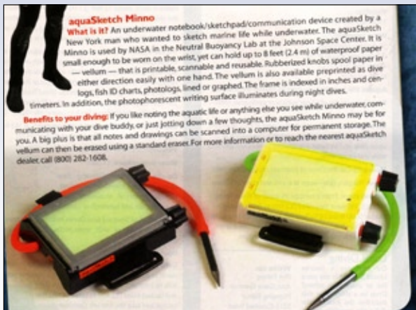
Dive Training April 2008

For more information, visit www.aquasketch.com