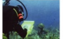
Marine Technology May 2008